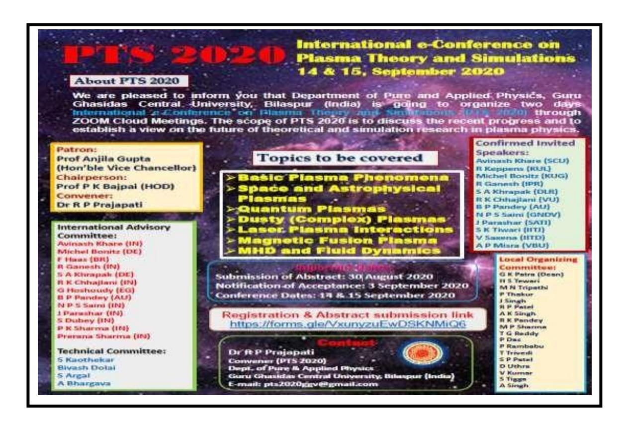
PTS 2020 brochure