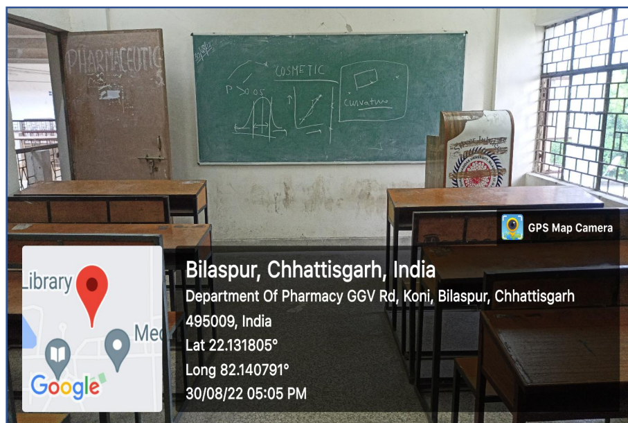
Class Room Number 07 of Department of Pharmacy