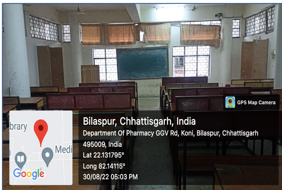
Class Room Number 02 of Department of Pharmacy