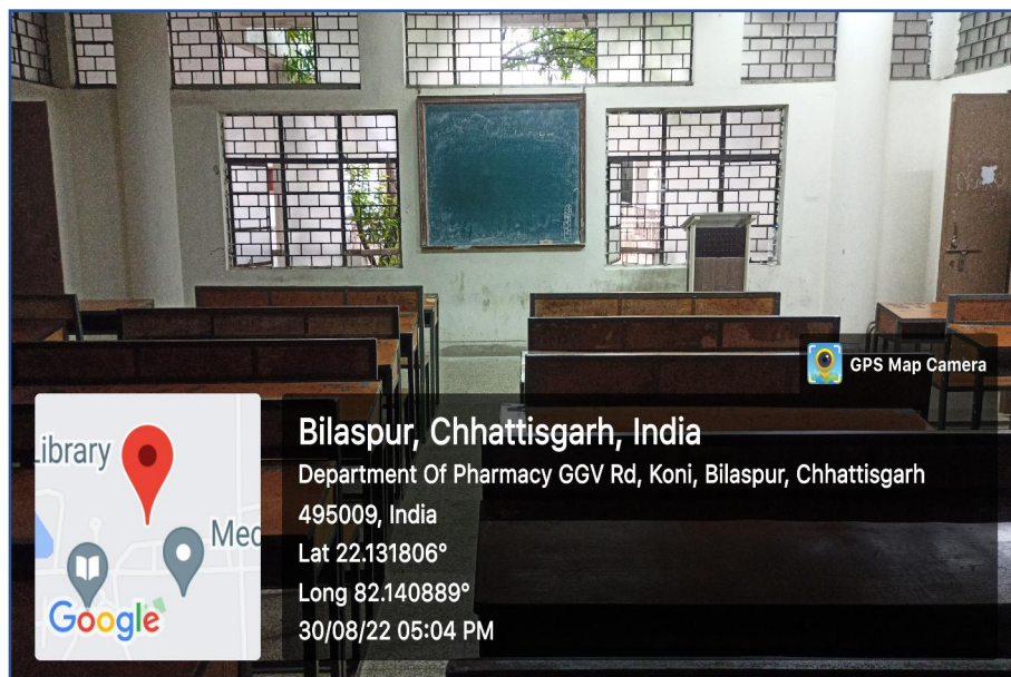
Class Room Number 03 of Department of Pharmacy