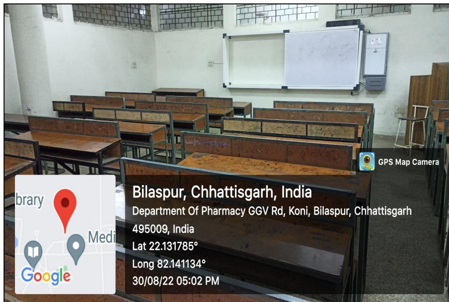
Class Room Number 01 of Department of Pharmacy