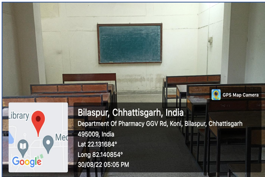
Class Room Number 08 of Department of Pharmacy