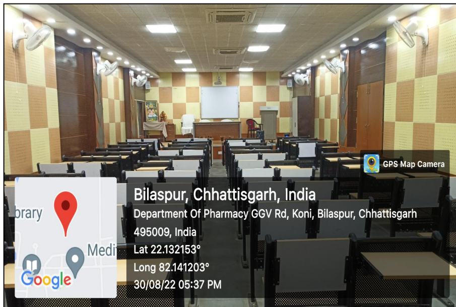
Semi Smart Class Room Number 04 of Department of Pharmacy