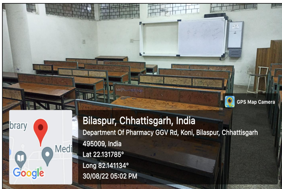
Smart Class Room Number 01 of Department of Pharmacy