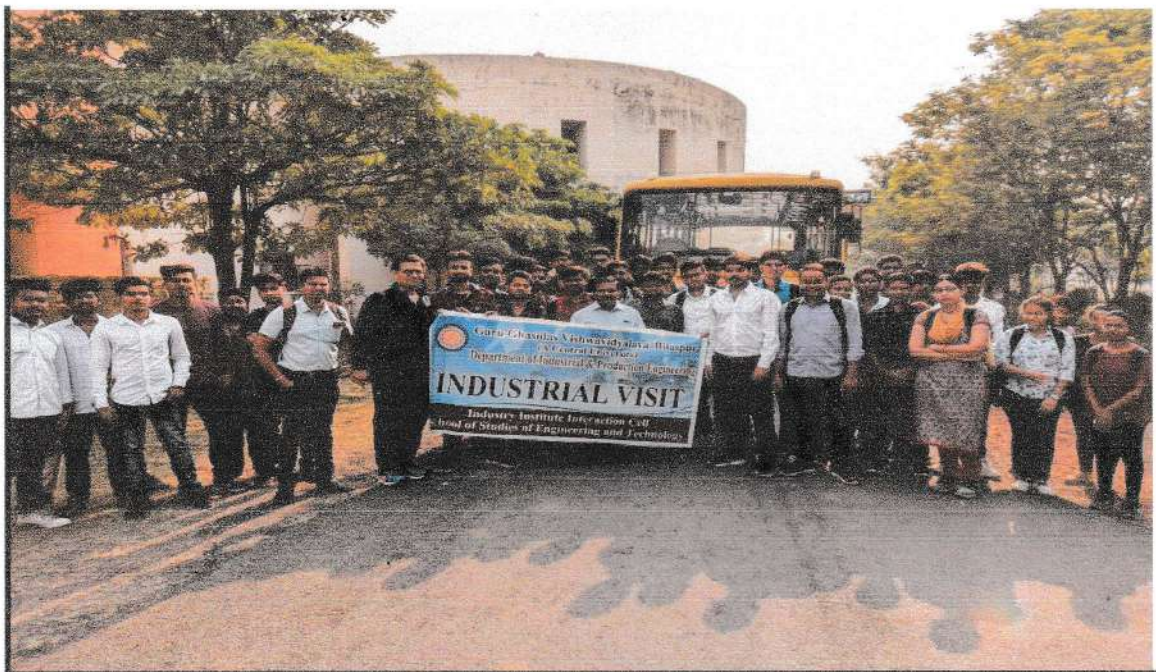
< Participants of the Industrial visit on 07/04/2022>