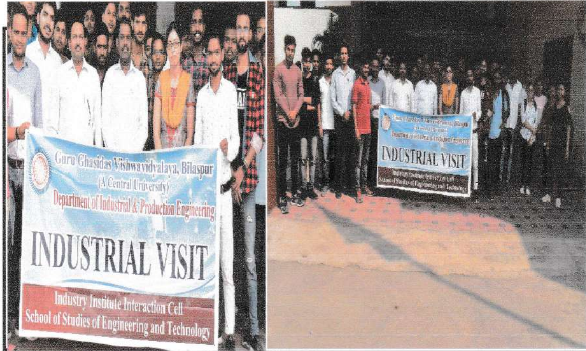
<Industrial visit Central Institute of Petrochemicals Engineering & Technology (CIPET): Institute of Petrochemicals Technology (IPT) - Raipur (C.G.)>

Guru Ghasidas Vishwavidyalaya (A Central University Established by the Central Universities Act 2009 No. 25 of 2009) Koni, Bilaspur - 495009 (C.G.)