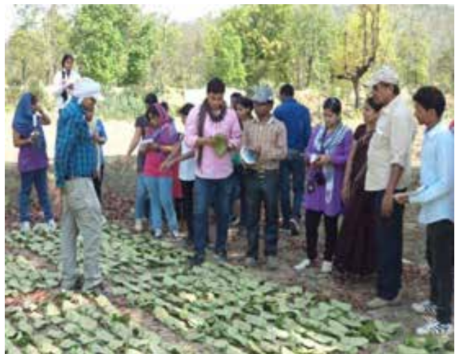
Visit of M.Sc. Forestry student to Sal forest