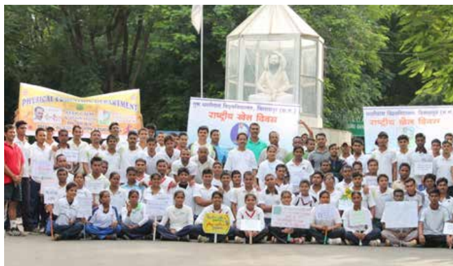
National Sports Day celebration