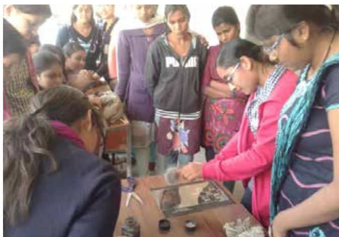
Tracing fingerprint impression