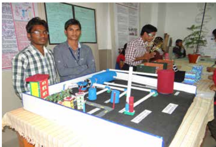
Nuclear Power model by students

The departmental library fulfills the requirement of the faculty members and students. A number of reference books and access to online journals is also available. The total number of books in the library is over two thousands and order has also been placed for many recently published books.