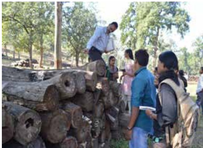
Students of B.Sc Forestry visiting a forest depot