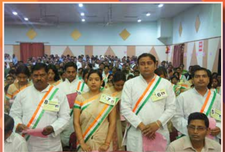
Students waiting for Oath Ceremony