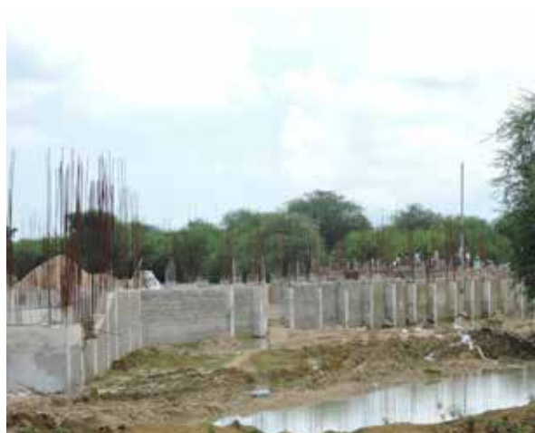
Upcoming building of the Department