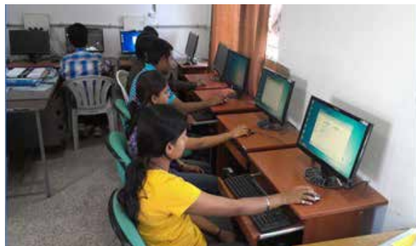
Lab – IV Programming Lab

Founded in 2000, the Department of Information Technology continues to build the nation by producing high class Engineer through education and research. In the past one decade, the Department of Information Technology has influenced society at levels that remain parallel among academic institutions. Its spin-offs are among the most successful corporate ventures in the nation, and many of the leaders in the academic and corporate research world are graduates from here.