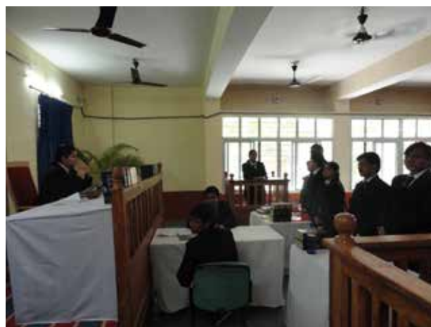
A hearing in moot court