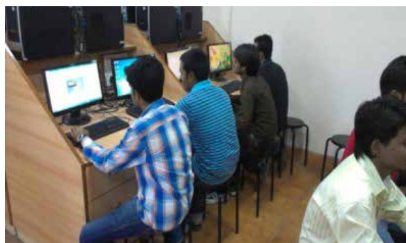
Lab – III Operating System Lab

Faculty members are dedicated to impart excellence in information technology to cope with recent market drift.