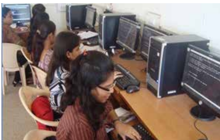
Lab – II Advanced Programming Lab

The Department focuses on overall development and strengthening the students through system thinking, problem solving, analysis, design, research, team work, communication skills, and readiness for lifelong learning. The courses run by the Department use mixed techniques of interactive lectures, guided case studies, literature surveys and project work that require team-work and critical and creative thinking. It emphasizes on undergraduate as well as graduate research activities. The quality policy is to pursue global standards of excellence in our endeavors and to remain accountable through processes of self evaluation and continuous improvement.