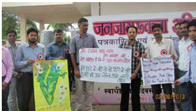
Public Awareness Rally on the Occasion of Independence Day