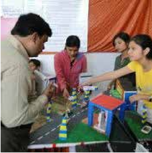
A student explaining about a model