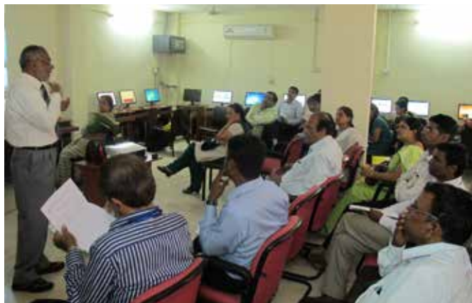
Participants and invited speaker during discussion session at a workshop