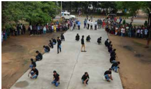
'Nukkad Natak' by the students of the Department

Ph.D. The curriculum is designed to enable students to develop skills related to media (Print, Electronic and New Media), Journalism & Mass Communication, Development Communication, Communication Research, Advertising, Public Relations and related courses/areas. The Department also undertakes the task of preparation of bulletins, newsletter, house journal, magazine and documentaries on various occasions. The Department also offers service to the Media Cell of the University to prepare reports, audio-visual recording of all events for University archives and for the wide circulation of the University related matters to media.