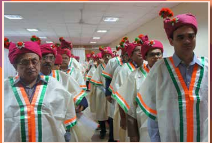
Proceeding Towards Convocation Hall