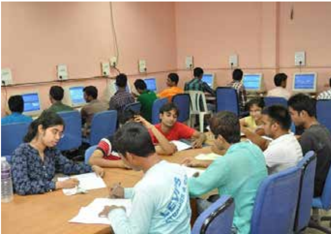
Study and interaction