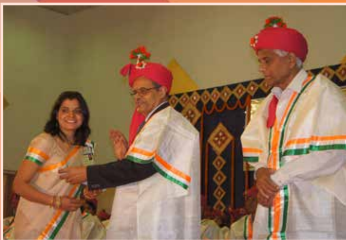
Student Receiving Degree