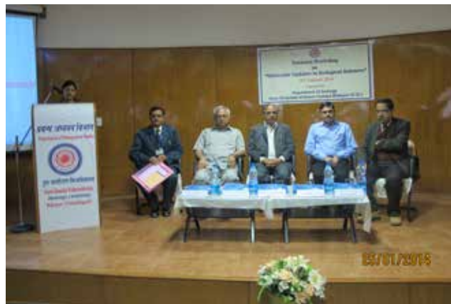
Dignitaries during National Workshop

Reader for protein and immune assay. In view of increase in the strength of the students, approximately 271 new books have been added in the departmental library. The Department offers Integrated UG/PG programme with an exit option after completion of three years with B.Sc. (Hon.) degree, and post graduate degree at the successful completion of ten semesters.