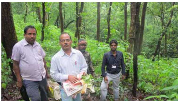
Plant survey at Achanakmar