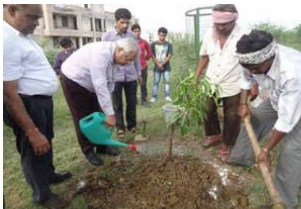
Plantation of mango sapling in the campus

The Department of Forestry, Wildlife & Environmental Sciences was established in the year 1989. Since its inception it is dedicated for promoting excellence in education to develop the students with innovative knowledge and skill and to cater to the need for trained forestry man power in India. The Department is actively engaged in the development and management of the campus and hence massive scale plantation has been done using fast growing avenue trees and ornamental species to beautify the campus with luxurious vegetation belts. In this context, plantation of important tree species has been successfully done besides managing natural vegetations of Palas and Babul in the University campus. The Department is pioneer in Central India where the forest cover is very rich in genetic diversity, medicinal valued plants and harbor different wildlife's.