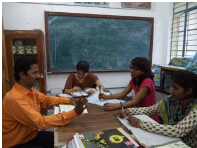
Mentor listening to the problems of the students

for B.A./B.Sc. students at the end of 3 years (Six Semesters) + M.A./M.Sc. 2 years) with effect from 2009-10 as well as two-years Master's Programme in Anthropology for entry of students directly. The Integrated Master's Programme offers courses on several aspects of Anthropology such as Social Anthropology, Biological Anthropology, Human Genetics, Human Ecology, Research Methodology, Anthropological Theories, Human Evolution and Adaptation, Medical Anthropology etc. Practical courses on Anthropometry, Serology, Human Genetics, Dermatoglyphics & Research Methodology are being offered to students pursuing B.A./B.Sc. and M.A./M.Sc. course in Anthropology. The Department has maintained a departmental library consisting of more than 700 books. With the upgradation of laboratory infrastructure and recruitment of faculty members, the Department offers new specialization in Biological Anthropology and Human Genetics (Genome) and Tribal Development in addition to existing specialization i.e. Social Anthropology.