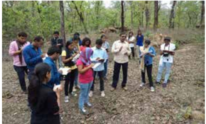
A Forest Officer instructing students regarding Forest Management practices