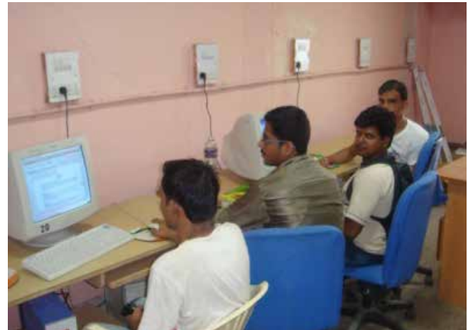
Learning through computers

and Operating System Lab. The Department has Licensed copies of DB2 Universal Database, Visual age for JAVA and web server applications. The Department provides opportunities to the students to carry out projects under joint supervision of the faculty and the experts from industries.