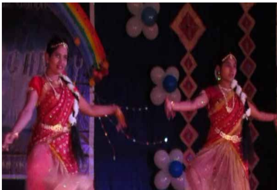
Cultural activity on Hostel day (Alchemy 2014)