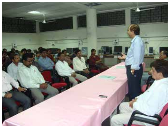
Photo-9 Guest Lecture

Vishwavidyalaya was involved in a week-long activities during Vishwavidyalaya Foundation week celebration from 12-18 January 2014. Institute has organized Blood donation camp and Model exhibition inside the premise of the institute. The details of the Institutional progress report are as follows:-