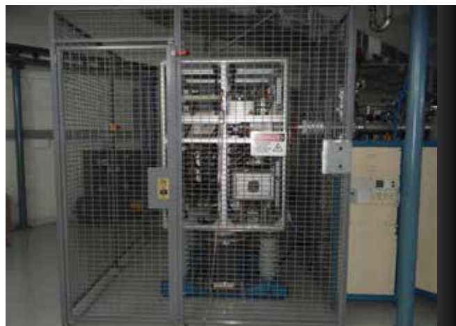
TORVIS ion source at site