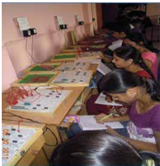
Lab I–Microprocessor Lab