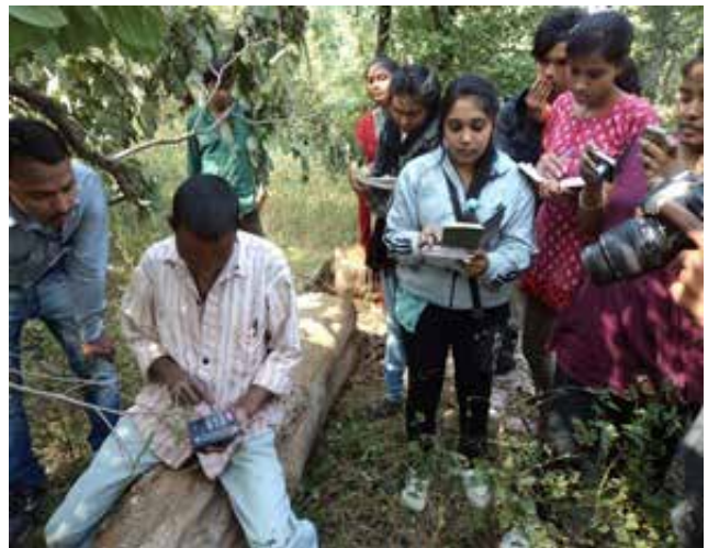
BSc Forestry students Learning about the calculation the quantity of wood in field