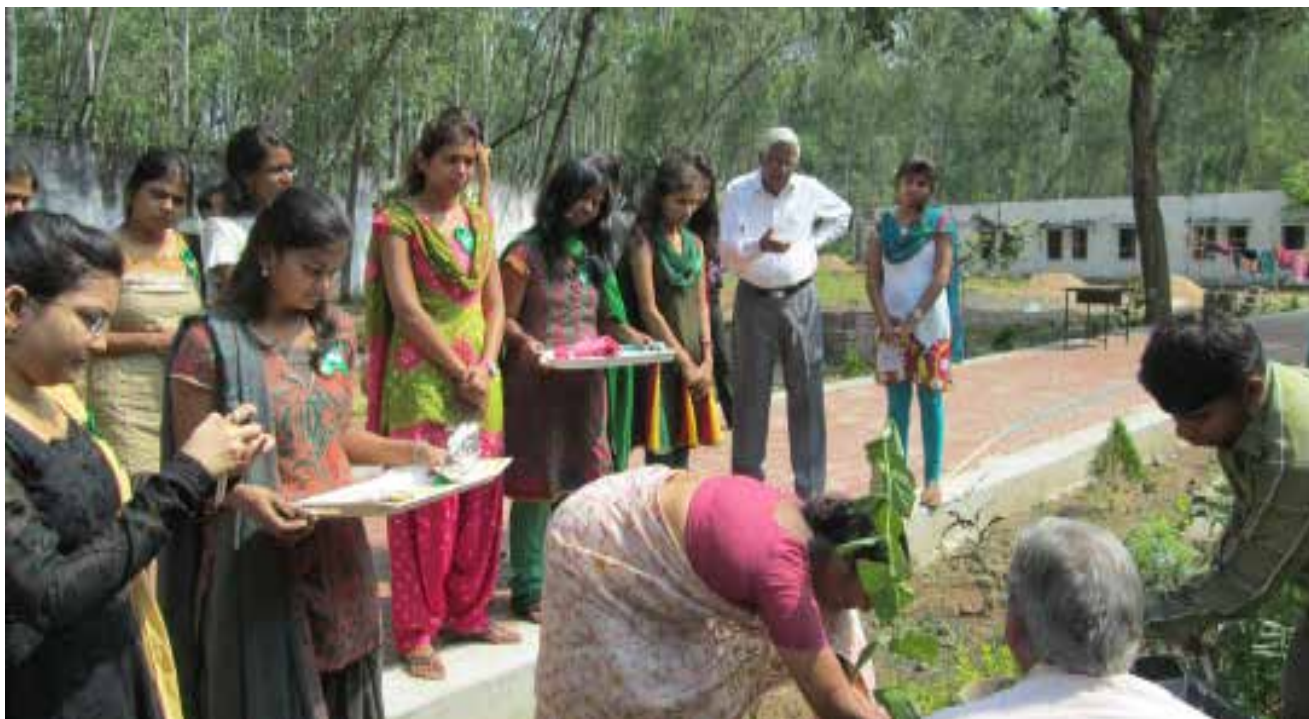
Plantation on Ecoclub Day

so that they can fulfill their dreams for their bright future. Hostel provides accommodation to 432 girl students. The category wise total number of girls accommodated in the hostel are Gen-184, OBC-129, SC-68, and ST-51.