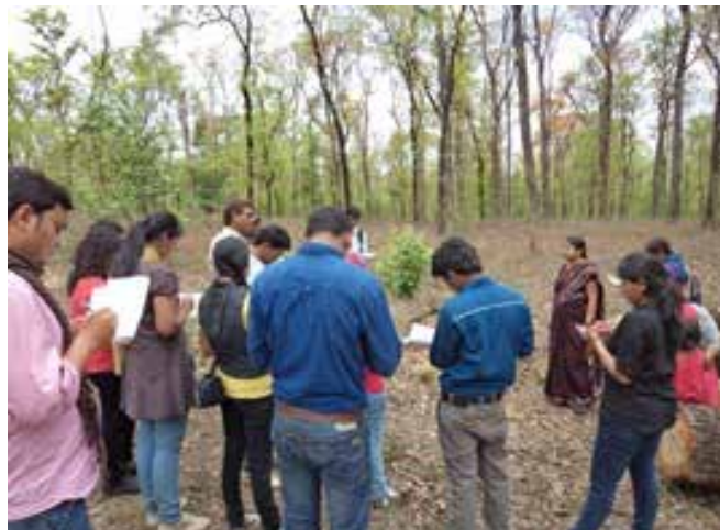
Visit of M.Sc. Forestry student to Sal forest