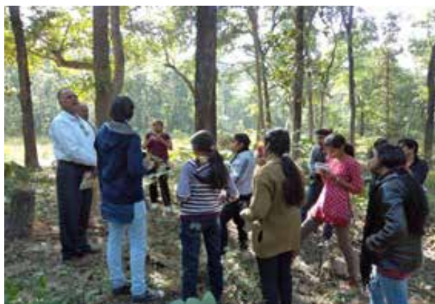
A Forest Officer instructing students in forest management practices