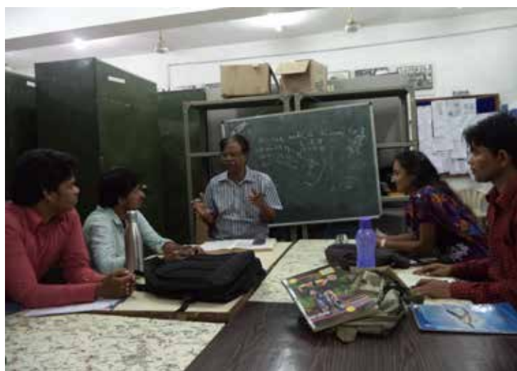
HOD teaching pre-Ph.d coursework class