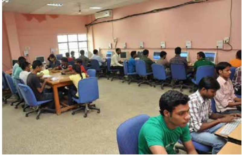
Students in Computer Lab