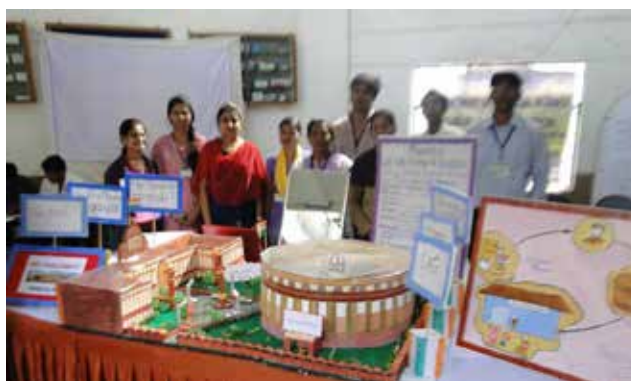
Models prepared by students