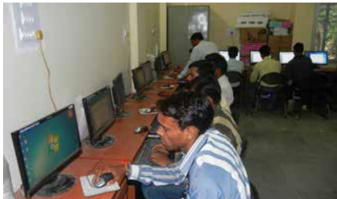
Students browsing through books