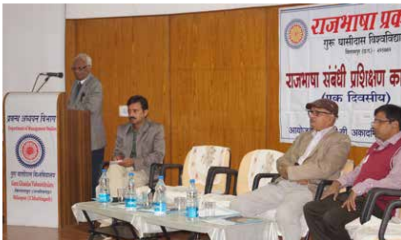
GGV Sponsored- Rajbhasha Workshop-III-27-12-13

Established in the year 1987, the Department of Hindi offers five years integrated UG/PG programme along with a PG course in Hindi and M.A. in Hindi Sahitya Evam Anuvad Vigyan. Apart from these courses, the Department is engaged in teaching one year Foundation Course to students of B.A., B.Sc., and B.Com. To promote Hindi Literature and Language the Department regularly organizes seminars, debates and poetry-recitation competitions. The departmental library has 1000 books and it subscribes to reputed journals. This year 400 new books have been procured. The Department continuously strives for inculcating the feelings of nationalism and emotional integration amongst the students and also tries to make the students understand the importance of Hindi.