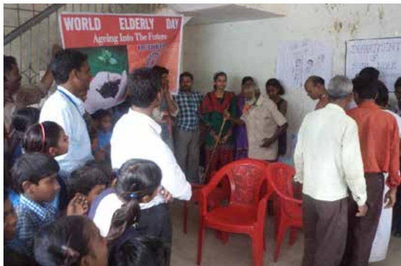
Recreational activities for the elderly on the occasion of World Elderly Day

era and the emphasis is always on quality education and promoting a culture of enquiry and quality of life. The Social Work Programme comprises classroom courses correlated with learning through field experience under various social settings. The mission of the Department of Social Work is to prepare students to become generalist social work professionals by enhancing their commitment to democracy, peace, human rights, people's empowerment, social justice and human diversity. Presently the Department is offering BSW, MSW and Ph.D. programmes. The intake in MSW is 60 and in BSW is 30. As a part of the educational experience, the programme provides students with opportunities to develop appropriate attitudes, skills and critical perspectives imbued with spirituality in providing services to the public, corporate, non-profit development sectors and civil society. Field practicum is the cornerstone of social work education and allows