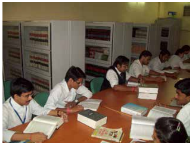
Students consulting books in library