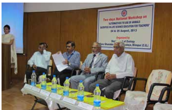
Honorable VC, Invited_Speaker, Dean, and HOD during a Two-days National Workshop