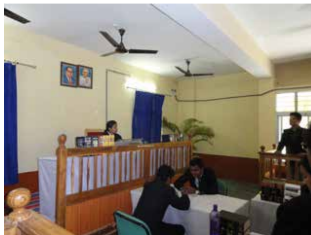
A moot court session in progress

It is one of the newest Departments in the University established in the year 2012. The Department aims towards the advancement of learning, teaching & diffusion of knowledge in the field of legal education. It also aims to catering to the needs of the society by developing professional skills of persons intending to make a career in advocacy, judicial services, law officer & legislative drafting as their profession. The objective of the Department is to evolve & impart comprehensive legal education at all levels to achieve excellence. Department offers two 5 years integrated programmes