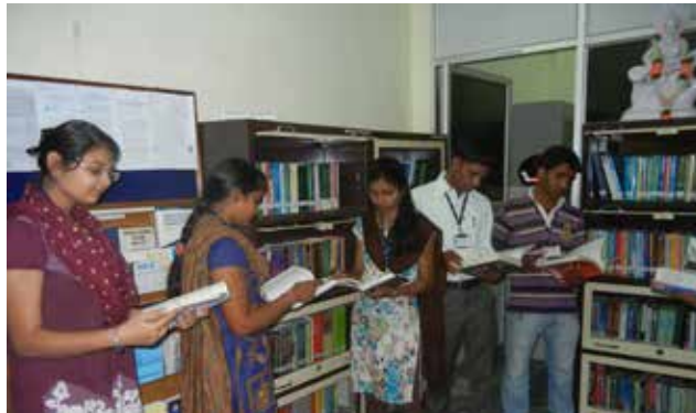
Students consulting web resources