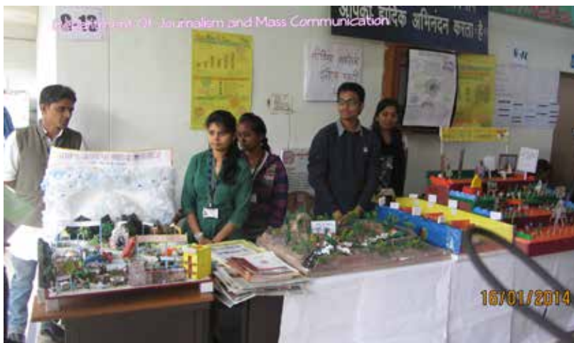
A Model on the Occasion of Annual Day

Established in the year 1988, the Department offers a postgraduate programme in Mass Communication and Journalism and five years integrated UG/PG programmes in addition to