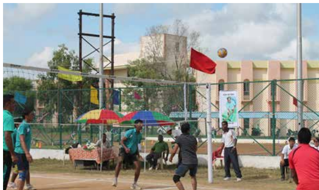
A volleyball match in progress

The Department of Physical Education and Sports was established in the year 1985 to provide quality education and expertise in the field. One year B.P.Ed. (Two Semesters), Two years M.P.Ed. (Four Semesters), and Ph.D. are the courses being offered in the Department. The Department owns well-kept play grounds, two basketball courts equipped with floodlights, a multi-station Gymnasium, a sophisticated sports science laboratory and a well-equipped departmental library. The infrastructure is developed as per the norms of the National Council for Teachers Education (NCTE). A team of competent instructors and teachers impart training and assignments. The Department also arranges coaching camps for various games and sports to improve the skills of the players and to upgrade their performance at different levels of events. 14 teams were trained and a total of 158 students participated in East Zone/ Inter-Zonal/ All India Interschool level tournaments in different sports events across the country. Sports Committee and Sports Board have been constituted to advise and monitor the sports activities undertaken by the Department.