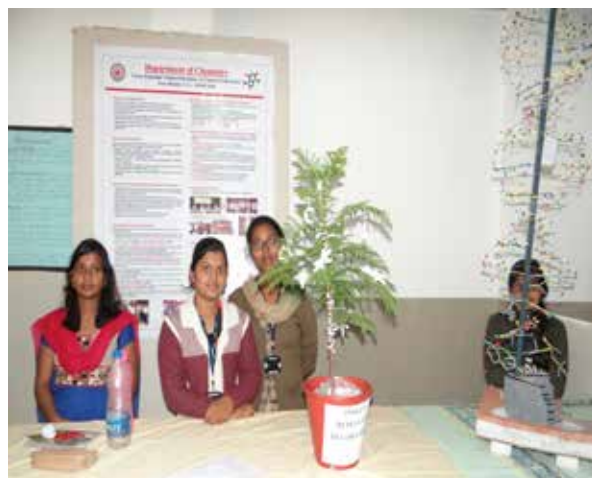
Students with their models