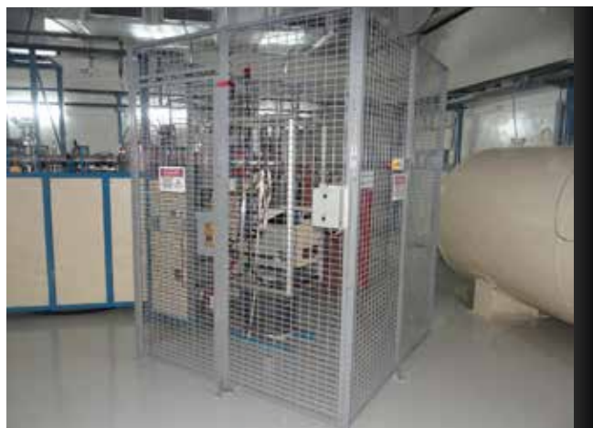
SNICS ion source in position

The basic principle of operation is the following. Cs vapor comes from the cesium oven into an enclosed area between the cooled cathode and the heated ionizing surface. Some of the cesium condenses on the front of the cathode and some of the cesium is ionized by the hot ionizer surface. The ionized cesium accelerates towards the cathode, sputtering particles from the cathode through the condensed cesium layer. Some materials will preferentially sputter negative ions. Other materials will preferentially sputter neutral or positive particles which pick up electrons as they pass through the condensed cesium layer, producing negative ions.