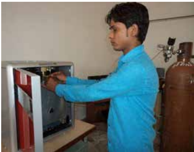
A Ph.D. Scholar analyzing soil samples in TOC