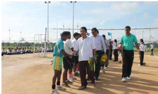
University Registrar, DSW, and Director, Physical Education greeting players