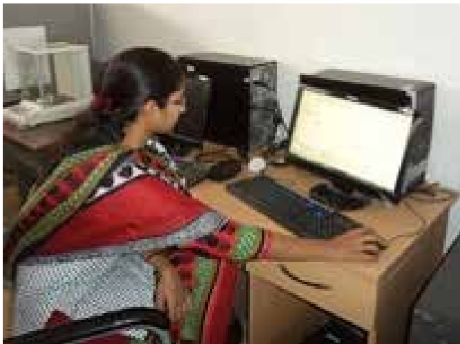
A Project Fellow working on CHNOS