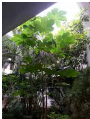
A Sterculia villosa plant