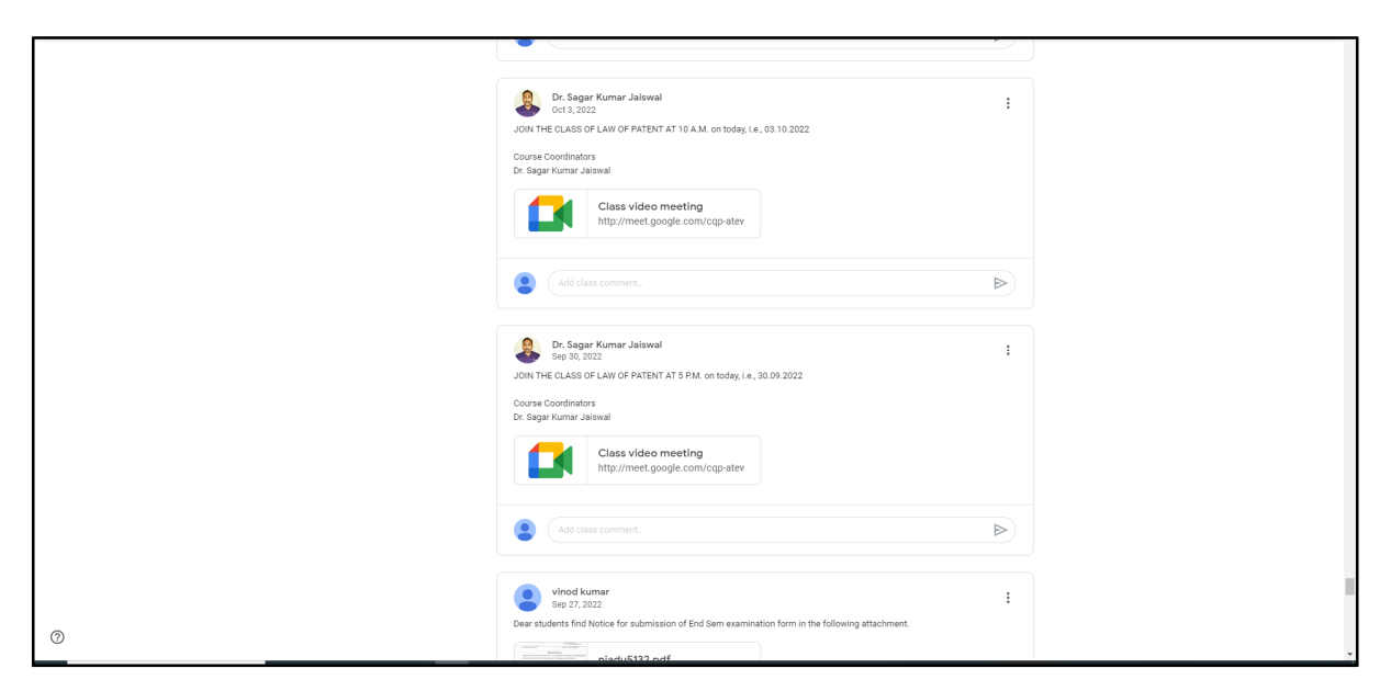
Fig 3: Video tutorials posted by faculty members

विभागाच्यत / HOD विभागाच्यत / HOD विधि-अध्ययन शाला / School of Law गुरू धासीदास विश्वविद्यालय Guru Ghasidas Vishwavidyalaya, बिलासपुर (छ.म.)/ Bilaspur (६.६)